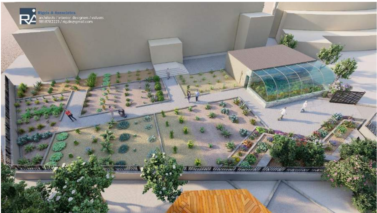
8. Botanical Garden.