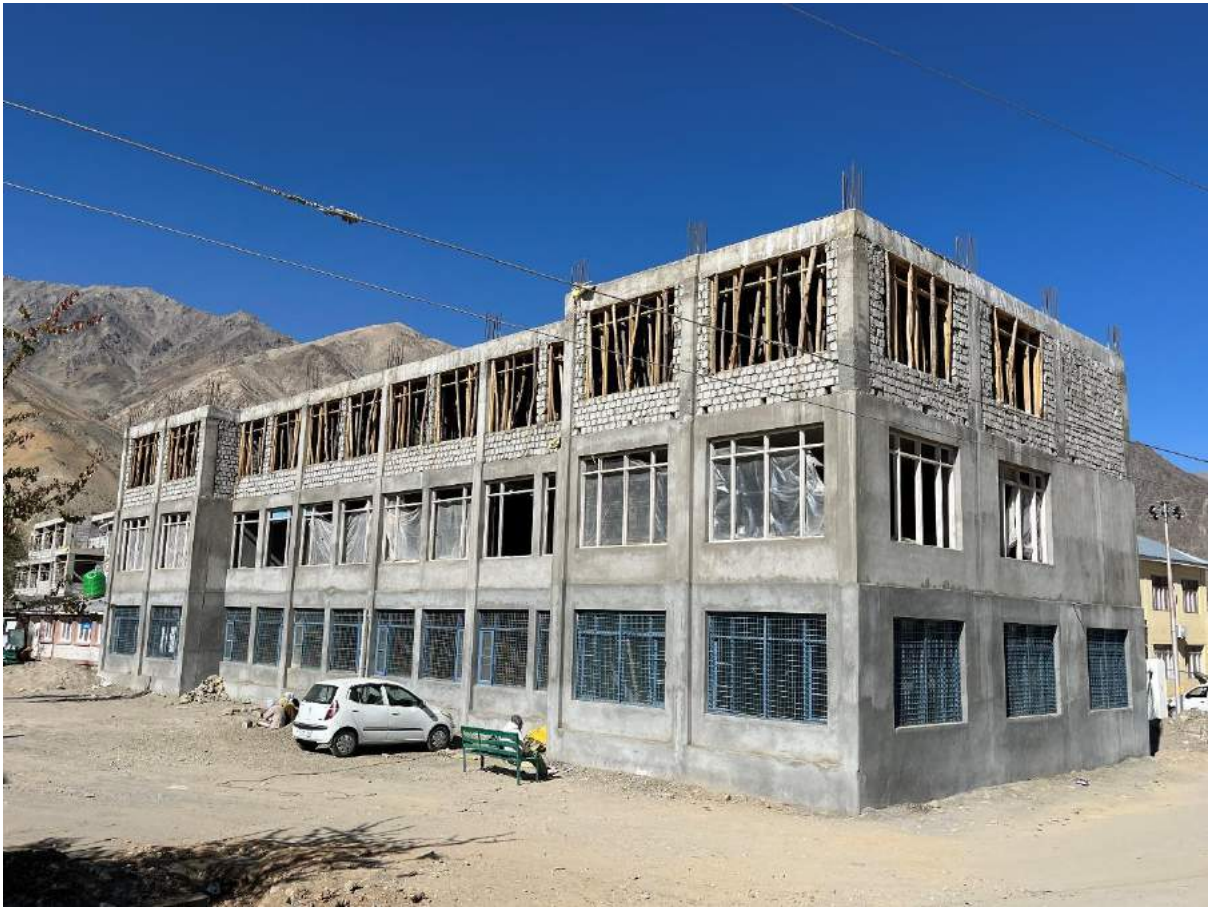
3. New Department of Commerce and Lecture rooms