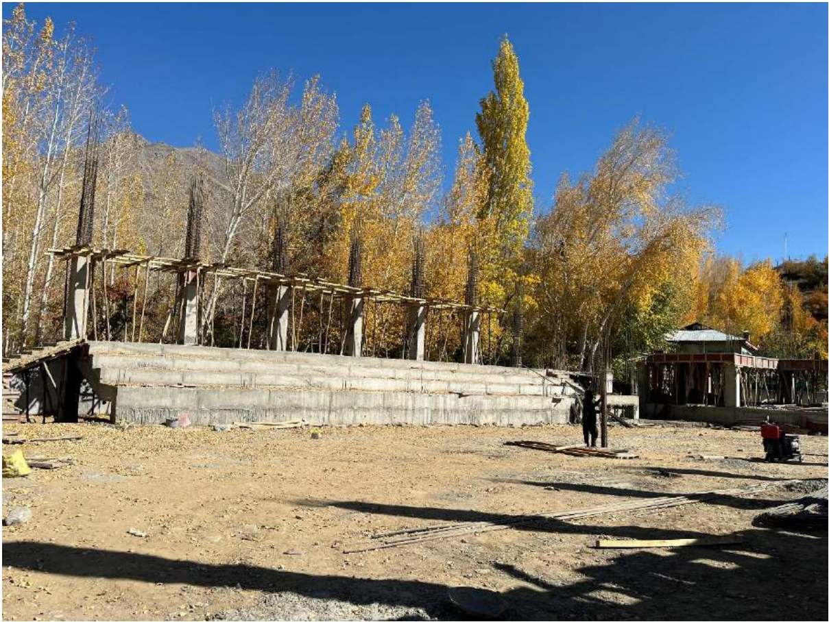
5. Indoor Stadium, Gym and Multipurpose Hall for the Department of Physical sciences