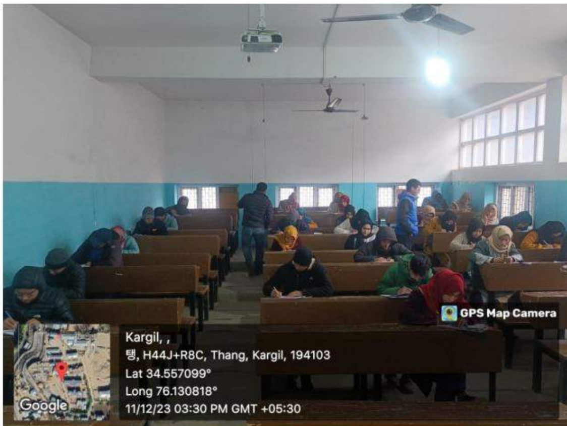
Room Number 08 Lecture Block