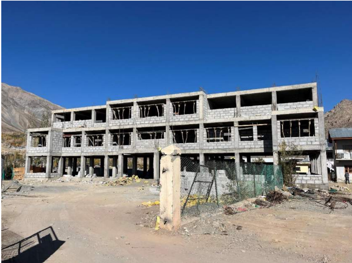
1. Laboratory block with State of art Science Museum and Laboratories. is under the head for department of Zoology and Botany and a Biological Museum.