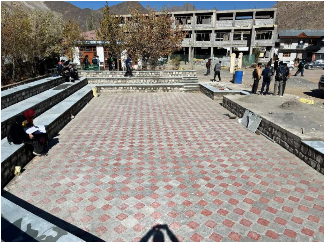
4. Open Air theater