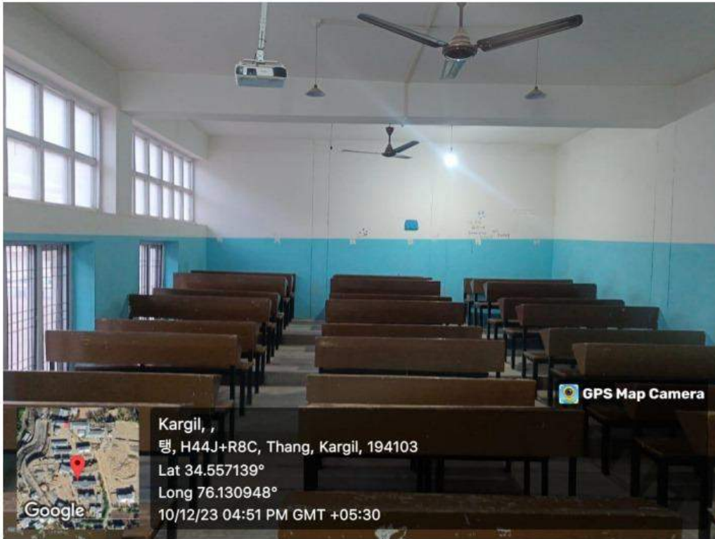
Room Number 09 Lecture Block