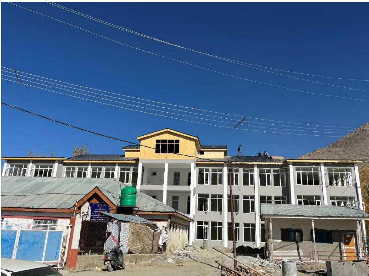
2. New Building for the Department of Biotechnology, Biochemistry, Geology under the head and a computer laboratory.