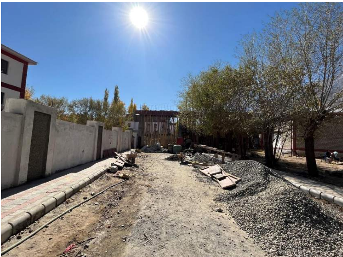
6. Construction of new Gate and tiled pathways. Under the new landscaping plan.