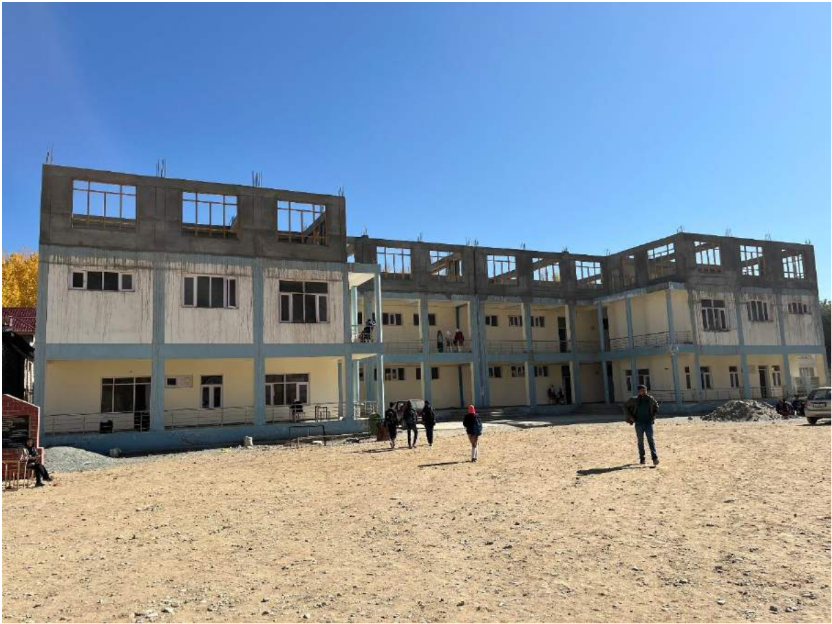
7. New Lecture Block and Examination Halls. Under the